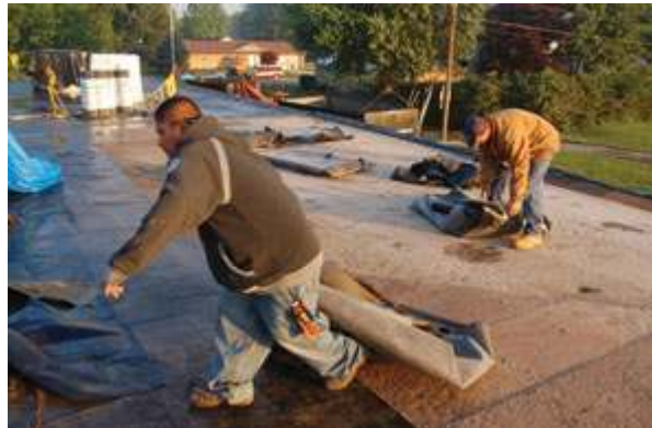
EPDM is removed from a ballasted system

NFI is the country's largest foam insulation board recycler. It operates on a national scale, collecting and hauling rooftop materials for commercial flat roof repair and replacement projects of all sizes. NFI brings more than 20 years of recycling experience to the roofing industry. Through its nationwide network, NFI has created an easy-to-use EPDM roof recycling program that has been used in 48 states and several provinces in southern Canada